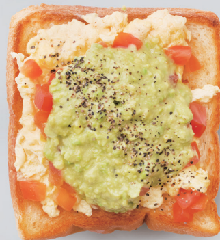
Guacamole With Scrambled Egg RM15.00