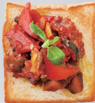
Caponata Toast RM11.00