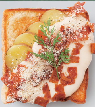
Raclette Cheese Toast RM15.00