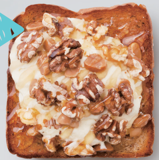
Mascarpone Cream With Nuts RM16.00