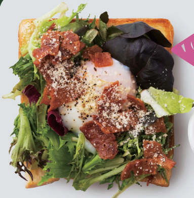
Lyon Salad Toast RM13.00