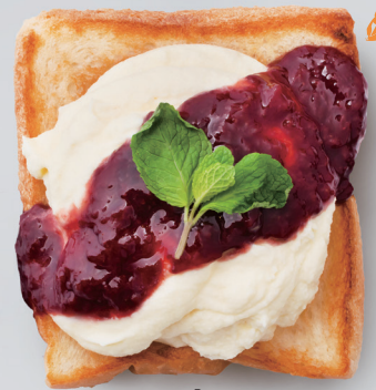
Mascarpone Cream With Confiture RM15.00