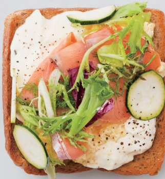
Mascarpone Cream With Smoked Salmon RM16.00