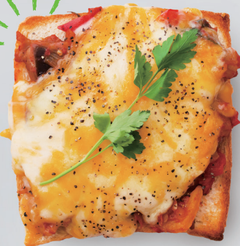
Lasagne Toast RM16.00