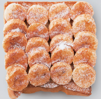
Banana Cinnamon Toast RM11.00